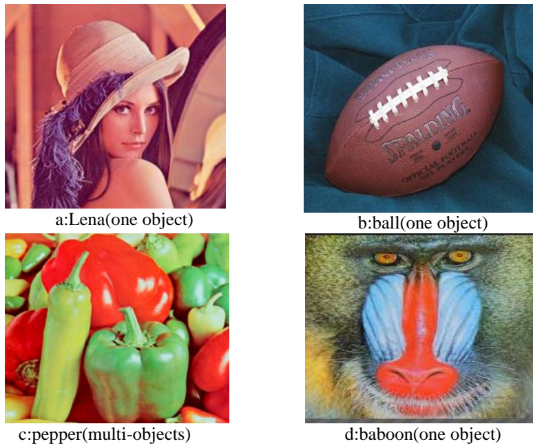
Fig. 1: image testing

Pepper (multi-object), and Baboon (one object) which are shown in figure (1) with the size of each jbg image is 256 x 256[27] .