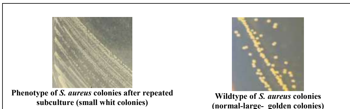
Fig. (3): normal phenotype of S.aureus colonies (on the right), SCV of S. aureus after repeated subculture (on the left).